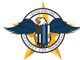
EXHIBIT BOOTH DETAILS